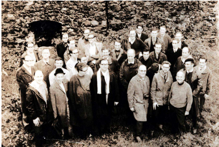
Figure 6: A 1970 hike around Oberwolfach