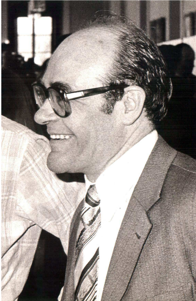
Figure 8: Another portrait