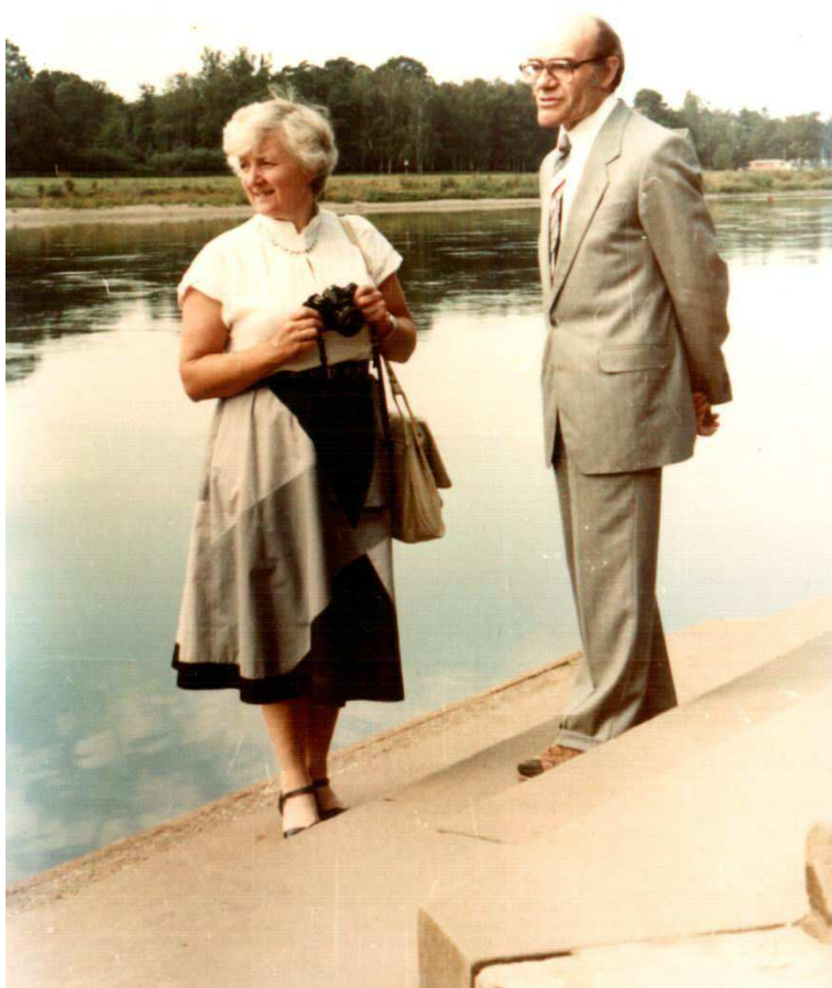
Figure 4: At the banks of the Elbe river